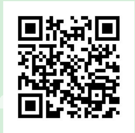
School Culture and Climate Family Survey