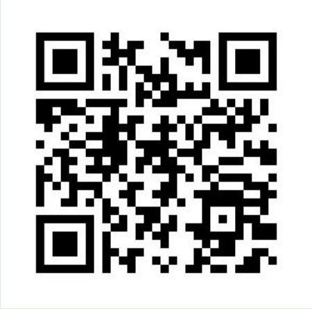
ESSA Grant Survey